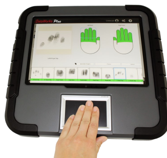
Tablet with Integrated Scanner

DeadScan Plus is a portable livescan device with an integrated ten print scanner that can capture rolled and flat fingerprints. Primarily designed to achieve quick identification of a dead body. Ideal for medical examiners, coroners, and crime scene teams.