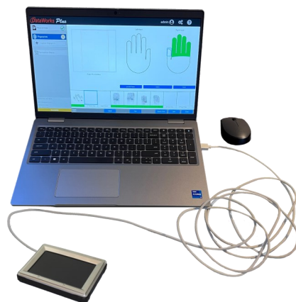
Laptop with Extended Scanner